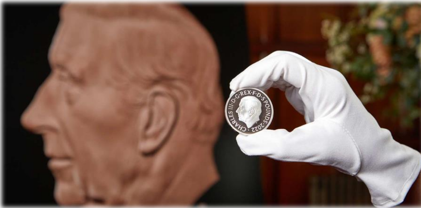
The Royal Mint unveils official coin effigy of His Majesty King Charles III

The Royal Mint has released the first new coin with the Head of King Charles III depicted on it.