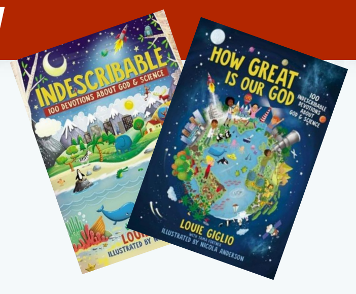
about God. We loved both books & learnt so much together." Carol Wilcock (Andy's Sister-In-Law).

"These excellent, devotional books are aimed at children aged 6-10 & are well written & illustrated. Each of the 100 devotions per book can be read independently, pairing a bible verse with amazing facts about things or people in the universe to teach truths