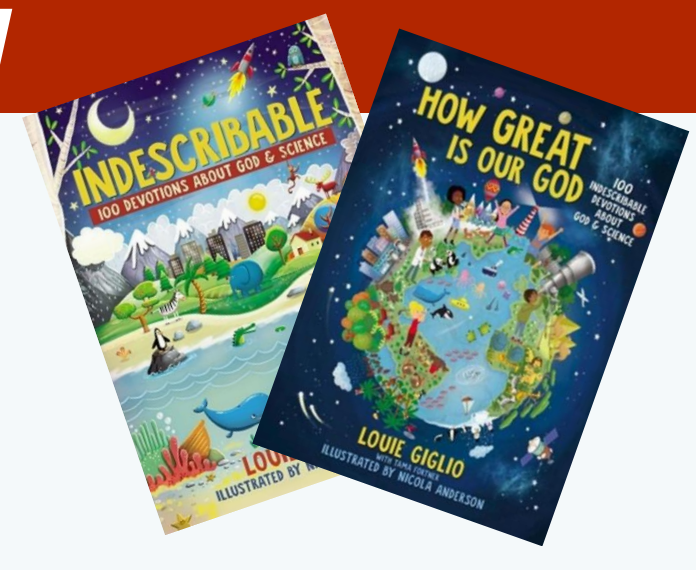
about God. We loved both books & learnt so much together." Carol Wilcock (Andy's Sister-In-Law).

"These excellent, devotional books are aimed at children aged 6-10 & are well written & illustrated. Each of the 100 devotions per book can be read independently, pairing a bible verse with amazing facts about things or people in the universe to teach truths